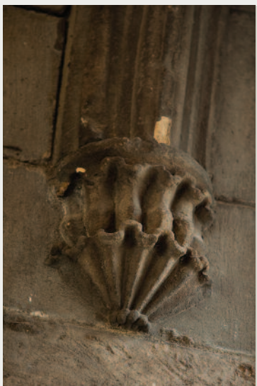
A SCALLOP SHELL A scallop may weel represent the Great Saunt Jamie, the first amang the apostles tae be martyred. Ithergates it could represent pilgrimage tae the cathedral.