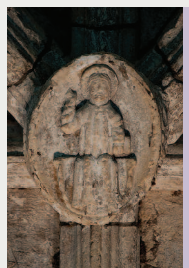
CHRIST IN MAJESTY A mindin oan the ayebidin authority o Christ, shawn as ruler o the world.

A BISHOP haudin a muckle gless o yill – or ale. The vicars o Elgin wernae allowed tae drink in the local howffs. Mibbie this cairvin o a bishop roarin fu wis meant as a mindin o thon restriction?